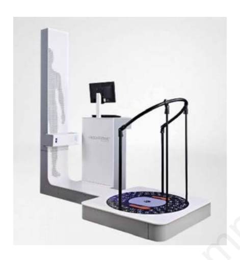
Figure 1. Device BT600.

comparable results. The differences between both methods were below 50 mL (Figure 3). Using dummies, reproducibility of BT600 measurements was 6 times better than same results, which were achieved by WD-method. The results with healthy sub-