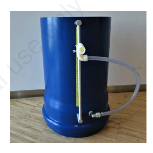
Figure 2. Water plethysmograph with variable overflow.