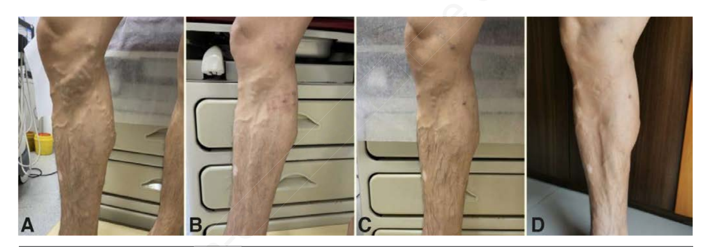
Figure 3. Case A. A) preoperative; B) 1 month postoperative; C) 4 month postoperative; D) 12 month postoperative.

PLPs act as perforating veins that supply superficial veins with reflux. The primary points of leakage are the Perineal Point (PP), fed by the internal pudendal vein or deep penile venous, and the