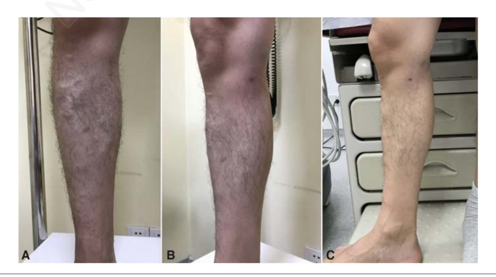
Figure 4. Case B. A) preoperative; B) 1 month postoperative; C) 12 months postoperative.