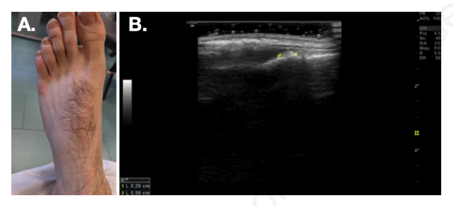
Figure 2. A. Venous aneurysm of the lateral marginal vein after foam sclerotherapy. B. Venous aneurysm of the lateral marginal vein viewed by ecocolorDoppler exam after foam sclerotherapy.