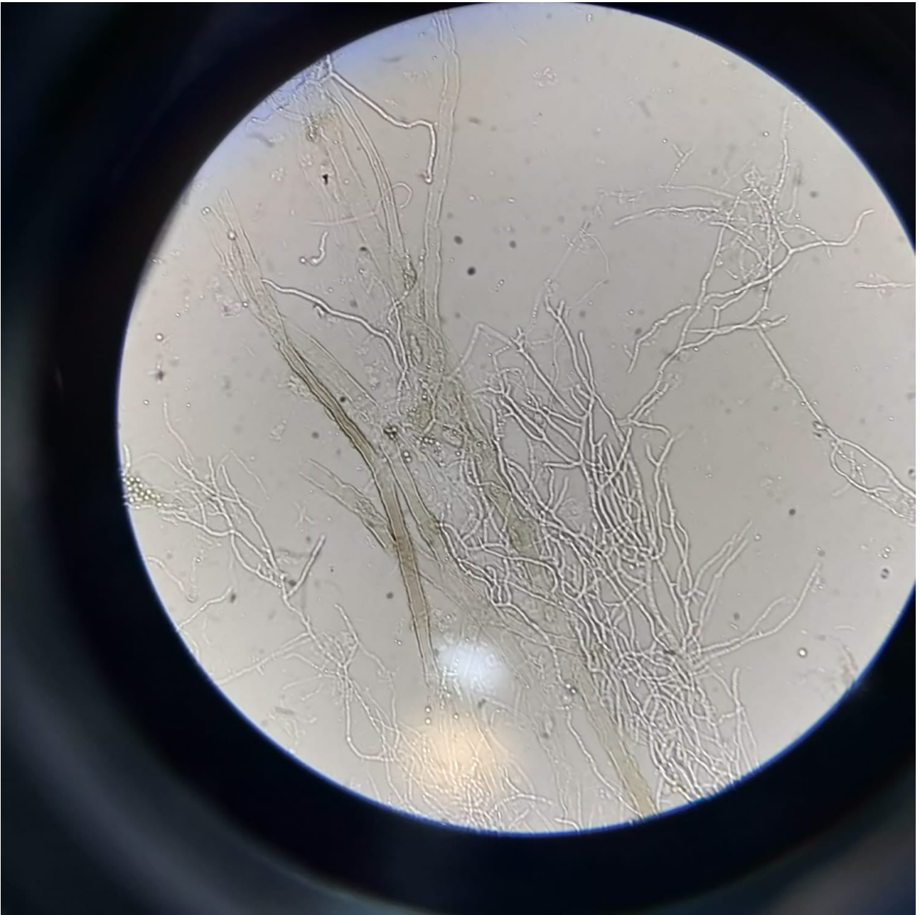
Supplementary Figure 2. Fungal KOH examination (400X): Two types of fungal hyphae- Later grew mixture of Aspergillus niger and Aspergillus flavus .