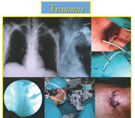
Thoracic Duct Iatrogenic Lympho-Chylous Leak