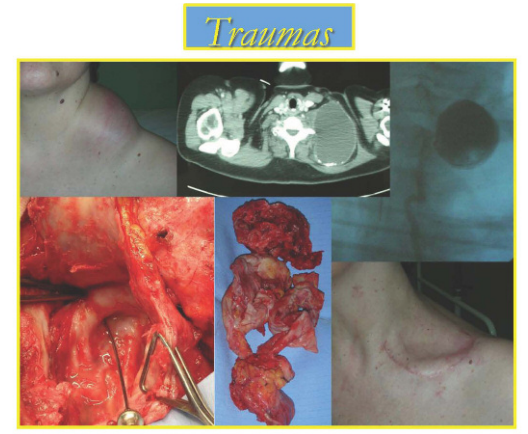
Post-traumatic Left Supraclavicular Lympho-Chylocele