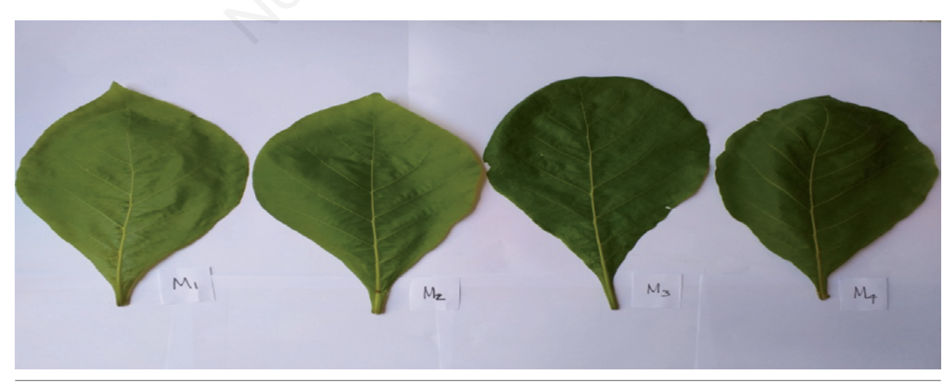
Figure 2. Appearance of teak seedling leaves on four types of growing media under drought stress.