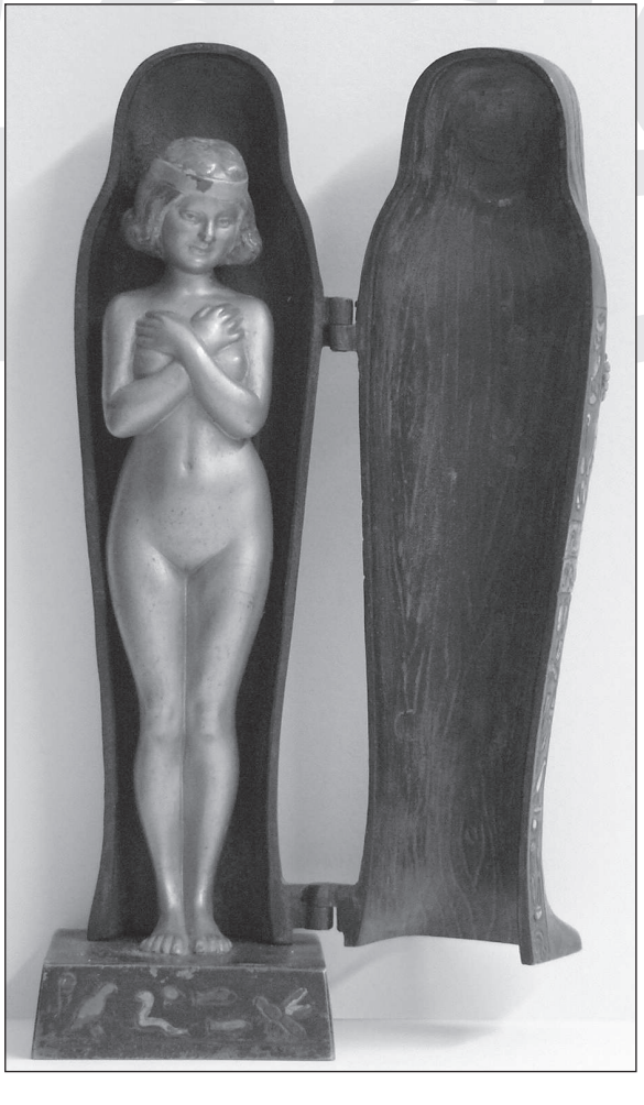
Fig. 2a-b - Victorian and Edwardian fictional mummies were erotic female figures. Brass erotic statuette by Franz Bergman, Austria, c.1905–10 (author's collection).

were stories about innocent victims of Tutankhamun. The supernatural world that initially avenged itself upon unbelievers now became sinister and met a European counter-attack. In Stoker's story, a mummy's unwrappers are killed by her pagan power, but the Christian God destroys her.