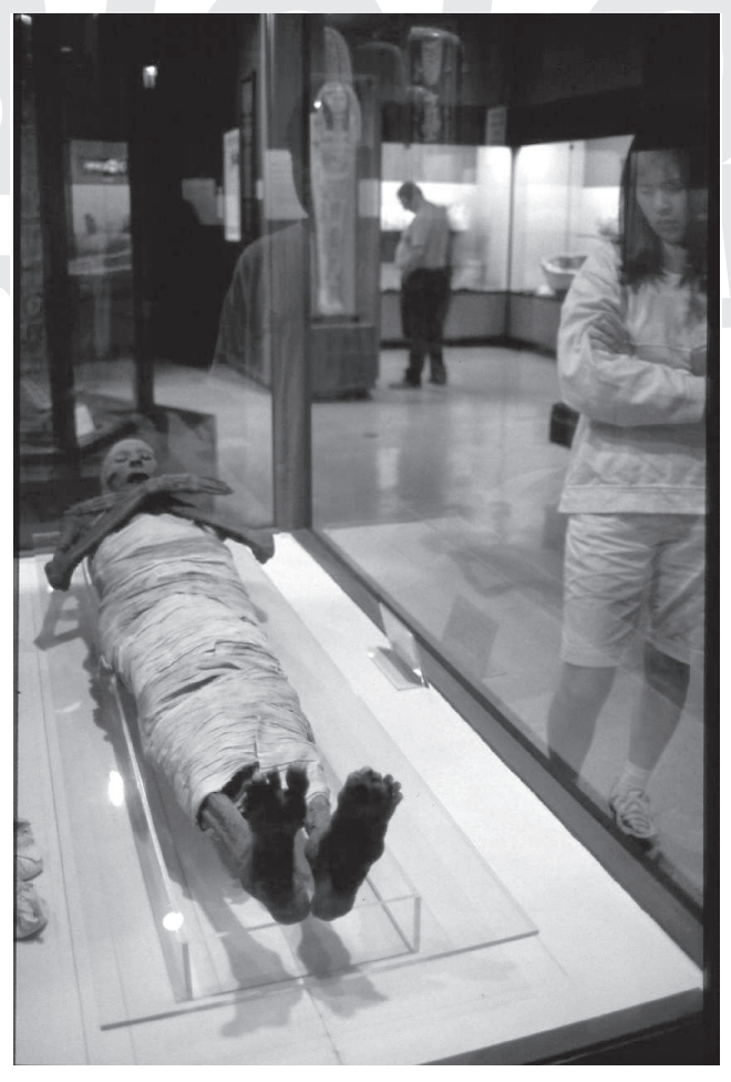
Fig. 1 - Museum visitors' interpretations of mummies are influenced by popular culture. Rosicrucian Egyptian Museum, San José.

Mummymania: mummies, museums and popular culture