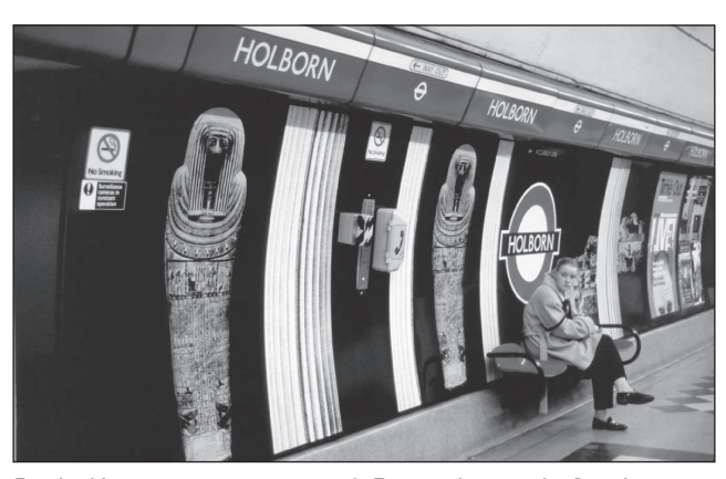
Fig. 4 - Mummies, synonymous with Egypt, advertise the British Museum in the nearby Holborn station of the London Underground.

I have heard children attempt to disgust family members with graphic descriptions of the removal of the brain and organs during mummification. Many juvenile questionnaire respondents described mummies as 'gross and cool'. Embracing pollution mocks the regimes of hygiene that adults impose upon children. Yet by enticing children with an empty promise that they will have an opportunity to misbehave, fictional mummies actually teach children how not to behave. Like movie mummies who take revenge but are defeated, juvenile fantasies that reject the status quo are tolerated because they have no power to change it. Many children surveyed asked whether mummies could revive and some experienced fear in museums. Children's books and cartoons simplify curse scenarios, omitting reference to disturbing the dead as the reason for