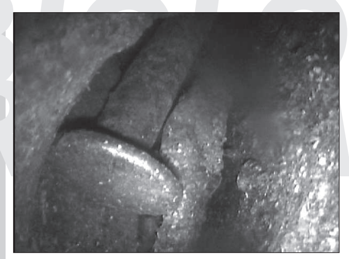
Fig. 2 - Endoscopic view of nail head within the nasal cavity.