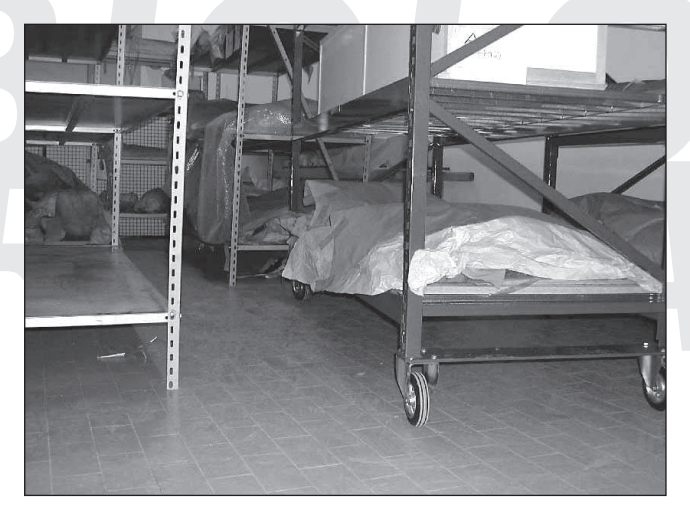
Fig. 1 - Precedent (left) and actual (right) set shelves easy to move.

The mummies deposit of the Egyptian Museum of Turin