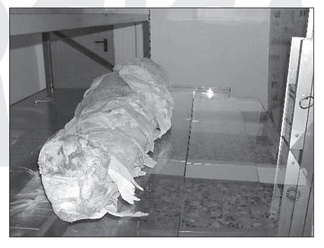
Fig. 3 - The possibility of moving the mummies in the set shelves.