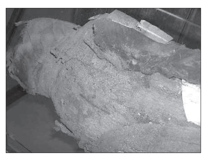
Fig. 4 - The underside of the head visible while the mummy is on one's set shelves