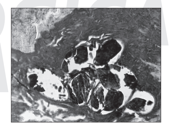
Fig. 4 - Burial XVI: Schistosoma eggs in mummified liver.

It is the mummified body of a 152-cm tall man in a very good state of preservation. Radiologically, its age was determined between 25 and 30 years. Careful study of his clothing turned out to be of Asian origin. No bone pathologies were demonstrated through plain radiology and CT-scanning. A minimally destructive autopsy (Lombardi, 1992) demonstrated lung and liver pathology. Both lungs were collapsed, but the left one showed a pleuro-pulmonary bands. The right hemidiafragm was depressed due to a possible massive pleural effusion. Representative samples of thoracic and abdominal organs were taken, as well as some hair for opioid testing. Following standard paleopathological procedures, clusters of eggs of Schistosoma japonicum were readily demonstrated in the liver (Fig. 4). This is the first time Far Eastern schistosomiasis has been demonstrated in a mummy out of Asia (Aufderheide and Rodriguez - Martín, 1998; Verano and Lombardi, 1999). The results from this study confirm the terrible conditions in which Chinese