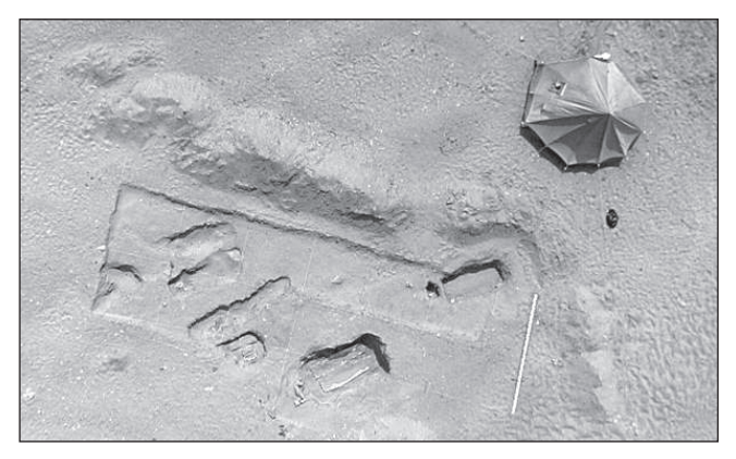
Fig. 2 - Caleta Panteón Cemetery.

Those harsh conditions of dryness and isolation spared full population of the island up to present. Nevertheless, its strategic location just across the major port of Callao, provided the island with opportunities of specific use over the centuries. In pre-historical times — before the 16th century, San Lorenzo just worked as a camping site for fishermen, as well as a burial site. Since the 16<sup>th</sup> century, over the whole colonial period, and early republic, the island's use shifted toward prison while it continued to be both a camping site for fishermen and sailors, as well as a cemetery. It was mainly during the 1800s that the island became a quarantine station for ships bound to Peru from all over the world. III passengers were secluded in a makeshift sanitary station until full recovery or death (Caleta Panteón). Accordingly, a neighboring area was assigned as the station's cemetery (Fig. 2).