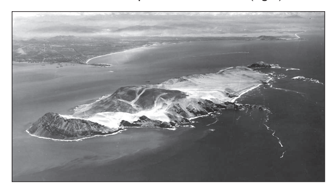
Fig. 1 - San Lorenzo Island.

San Lorenzo Island, the largest oceanic island in Peru, lies just 5 miles off the coast of Lima. Nevertheless, different reasons have caused it to be almost totally isolated from the intense life of the Peruvian capital. Historically, fishermen are known to have come to the island since the pre-ceramic period, around 5.000 years ago, or even before. No permanent settlements could ever be founded – at least during the prehistorical periods, since there San Lorenzo lacks any sources of fresh water. Indeed, San Lorenzo resembles any other part of the Peruvian coastal desert, only that a bit drier. Drizzle precipitation is reduced to few centimeters a year, especially over the Southern hemisphere winter months (Fig. 1).