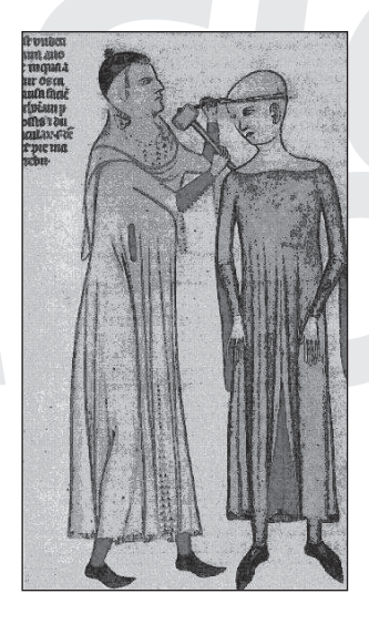
Fig. 1 - Exeresis of the brain.

The position of the heart - known for its symbolic