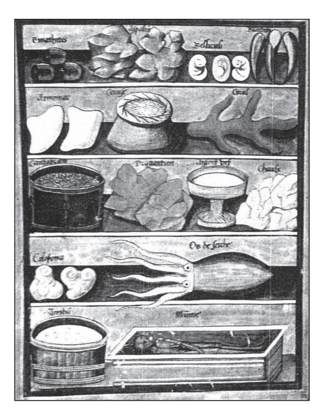
Fig. 4 - The mummia in the medieval pharmacopoeia.

Finally, a curious note: in addition to the common definition