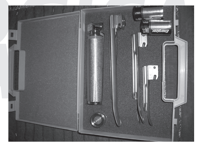
Fig. 4 - Portable laryngoscope

We sampled the entire collection of 418 mummies using what we believe should become a standard piece of