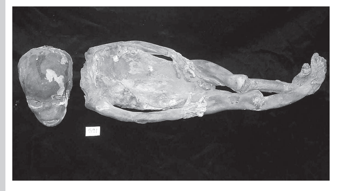
Fig. 1a-Another child mummy