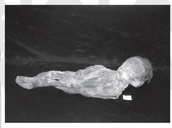
Fig. 1 - Well preserved child mummy