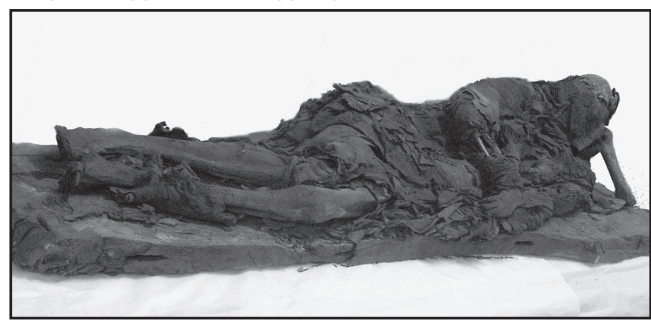
Fig. 1 - Picture of "The Mummy in the dress".

The mummy wears a pleated dress over its bandages; the body is wrapped on the upper part while there is no