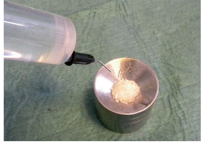
Figure 14. Heterologous bone hydration before grafting.