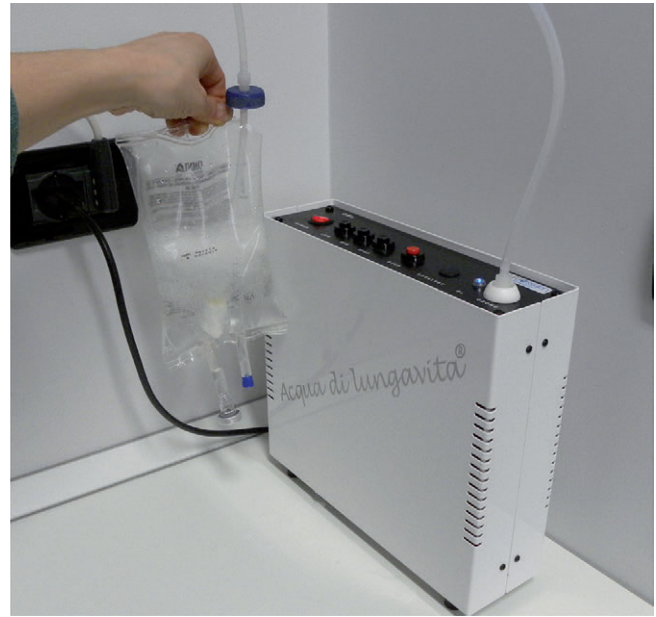
Figure 6. Picture of saline ozonization.