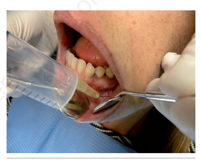
Figure 9. Picture of gas inoculation in mucous graft.