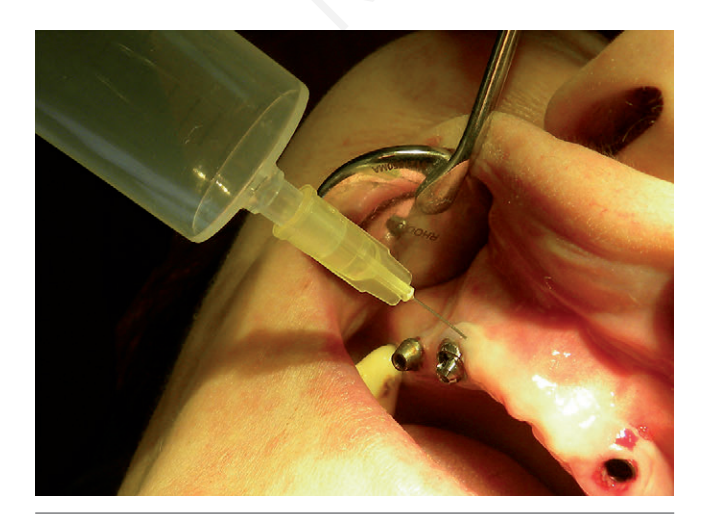
Figure 12. Treatment of perimplantitis.