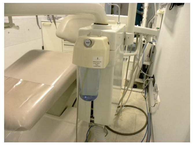
Figure 3. Picture of the autonomous water system on the dental unit.