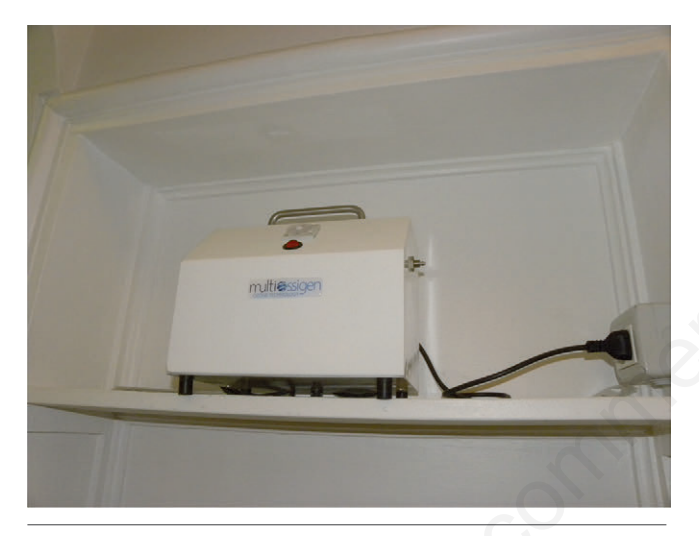
Figure 1. Picture of gas machine Air King Multiossigen [Multiossigen, Gorle (BG), Italy].

If the dental chair is equipped with a mains independent hydraulic circuit, it is possible to hyperozonize the dental unit water before use and with great ease to decontaminate the dental unit. The dental chair is in fact equipped with very small hydraulic circuits in which the stagnation of liquids is encouraged. The sup-