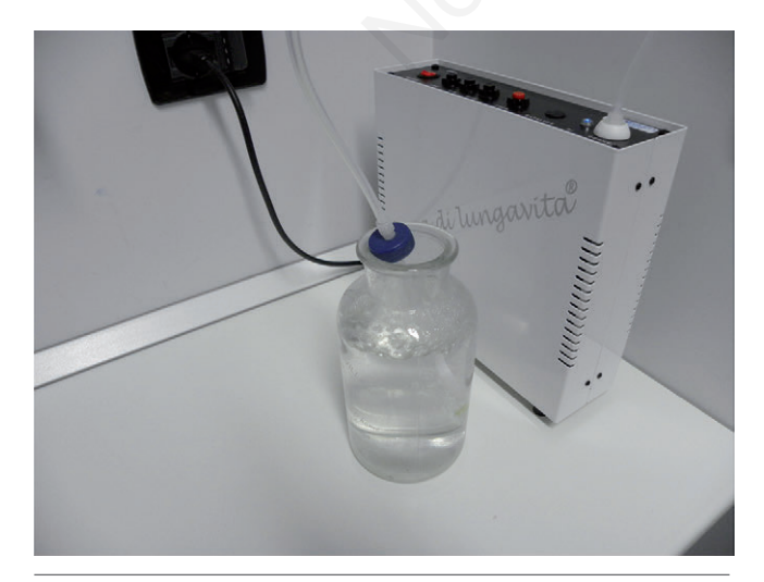
Figure 2. Picture of OM3 Multiossigen [Multiossigen, Gorle (BG), Italy].

During surgery, various cooling and intraoperative washing solutions are used. The use of sterile solution of double-distilled water and hyper-ozonated physiological solution (level high multioxygen OM3) make the cleansing and disinfectant action of these solutions much more effective. Using hyper-ozonated solutions to cool surgical handpieces, piezo-electric and ablator handpieces, a more effective debridement of the bacterial biofilm<sup>1</sup> is achieved