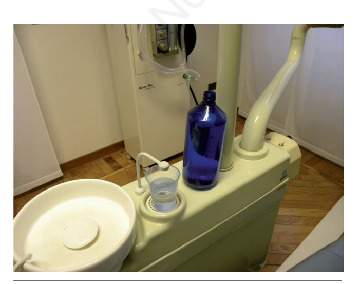
Figure 5. Picture of rinsing with hyper-ozonated water.

After having exposed the implant with a surgical flap, carefully removing the infected granulation tissue surrounding the perimplant lesion, the exposed surface is scaled using hyper-ozonated water. The cleansing of the implant surface will be carried out thanks to a mechanical action given by the action of the scaler and also thanks to the use of hyper-ozonated water. Optimization of results in the treatment of perimplantitis can be achieved as soon as an intraoral device (silicone cap) can be packaged to create a