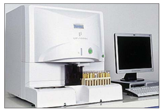
Figure I. The UF-1000i instrument.

applies the criterion of the routine ie, the bacterial load has a meaning according to the type of patient considered, as in the case of catheterized patients or pediatric patients.