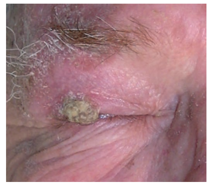
Figure 1. Eyelid squamous cell carcinoma on lichen planus.