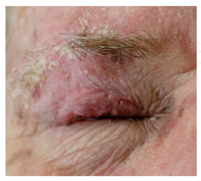
Figure 2. This picture was made 18 days after surgical resection and simultaneous reconstruction with retroauricular graft.