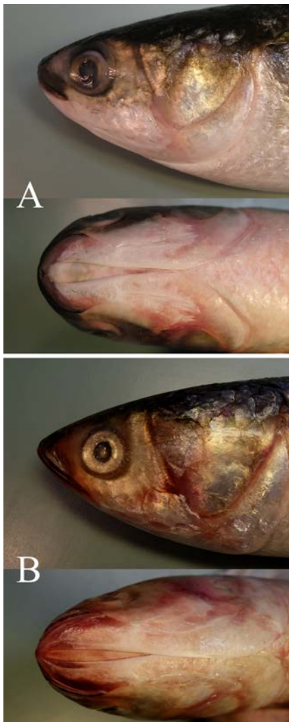
Figure 3. Lateral and ventral view of mouth in Mugil cephalus (A) and Mugil capurrii (B).