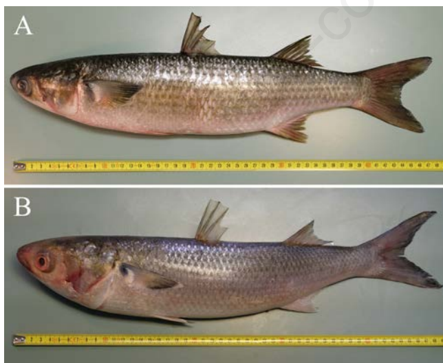
Figure 1. Adult specimens of the Mugilidae family: A = Mugil cephalus ; B = Mugil capurrii .

Therefore, we decided to study in depth the manageability aspects regarding the differential identification of the two Mugil species of the Eastern Central Atlantic coasts ( Mugil cephalus and Mugil capurrii ), upstream as well as downstream of the supply chain. The availability of vouchered sequences of the other Mugil spp. sharing the aforesaid FAO area ( e.g. Mugil bananensis , Mugil curema and Mugil curvidens ) has not been verified because these species reach too small adult medium lengths (Harrison, 2016) and, therefore, the ovaries