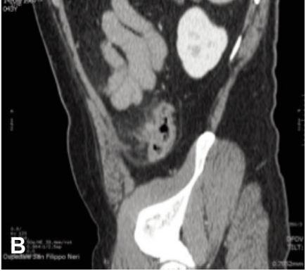
Figure 1. Presence of hyperdensity of left pericolic adipose tissue with thickening of the adiacent intestinal wall.