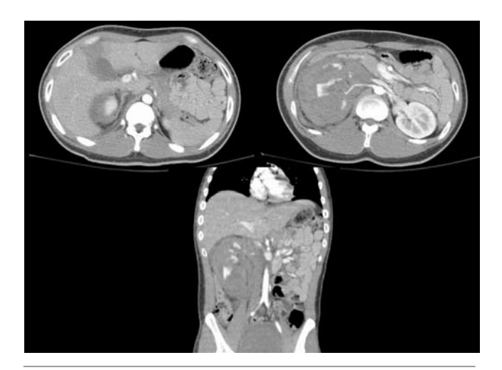
Figure 1. CT scan revealing both a Grade V right renal injury, and a Grade V hepatic injury.