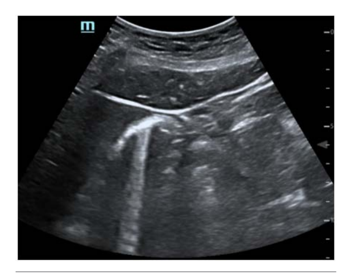
Figure 2. Ultrasonography still image showing gas within gall-bladder concerning for a fistula tract between gallbladder and small bowel.

Point-of-care ultrasonography is a valuable diagnostic tool in the evaluation and diagnosis of gallstone ileus in the emergency department. It increases the sensitivity to diagnose gallstone ileus when combined with abdominal radiographs. It has particular benefits over CT including efficiency, cost, radiation and is without intravenous contrast. POCUS should be considered a useful adjunct to diagnosis of gallstone ileus to expedite diagnosis and treatment. CT imaging should remain the gold standard to evaluate and rule out other etiologies of small bowel obstruction.