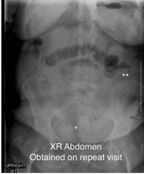
Figure 1. Abdominal computed tomographic (CT) scan and X-ray (XR) demonstrating air fluid levels, small bowel dilation and presence of an ectopic gallstone near location of terminal ileum. *Denotes location of ectopic gallstone; **Denotes presence of air fluid levels.

(POCUS) with abdominal plain films as an early adjunct for evaluation and diagnosis of gallstone ileus in elderly patients to expedite care. CT imaging, with or without contrast, should be obtained to rule out other possible etiologies for bowel obstruction. Her ileus was diagnosed using abdominal plain films which visualized a small bowel obstruction and an ectopic stone. Bedside ultrasonography was used to visualize aerobilia as well as small bowel obstruction confirming her final diagnosis of gallstone ileus. She was expeditiously admitted, went on to have a diagnostic laparoscopy followed by mini laparotomy with enterotomy and gallstone removal. The patient fortunately had an uncomplicated postoperative recovery and was discharged on postoperative day three.