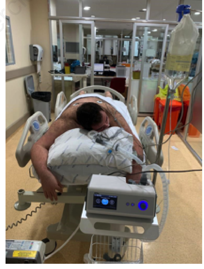
Figure 2. The patient treated in the ICU by being placed in the prone position.