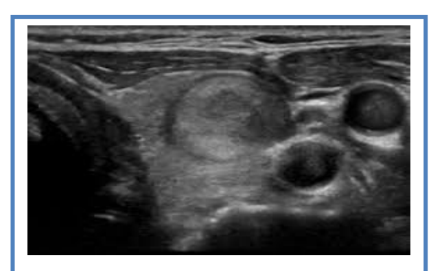
Fig 2. Ultrasound features shown in the figure of hypoechoic thyroid nodules proved as papillary carcinoma by cytology

Ovoid to round and Wider than taller against of Taller than wider we were (OR 0.0001, CI 0.00002- 0.0008) and (OR 0.042, CI 0.015- 0.113), For features of Halo; thin and Incompletely thin against of Absent, we got respectively (OR 0.059, CI 0.030- 0.116) and (OR 0.432, CI 0.283- 0.659) and for features of Doppler central flow; negative against of positive we received at (OR 0.019, CI 0.004- 0.085). Table 3 suggests the calculated sensitivity, specificity, predictive vales and accuracy of thyroid nodules by ultrasound features. Figure 1 shows the ROC curve for the sensitivity and specificity of US, shape had the greatest predictive ability (AUC= 0.962), and then