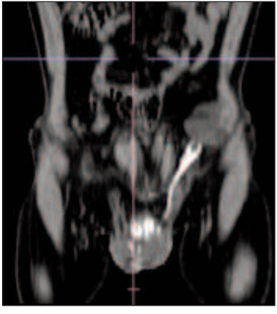
Figure 2. Postoperative third month. The reservoir can be seen under the external and internal oblique muscles.

with classical methods such as scrotal or infrapubic incision, it may damage the neobladder, the intestines, and even the inferior epigastric vessels (2, 3).