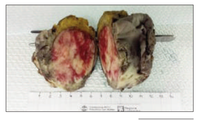
No conflict of interest declared.

on cutting the specimen presents white-grey nodular lesion of around 6-7 centimetres.