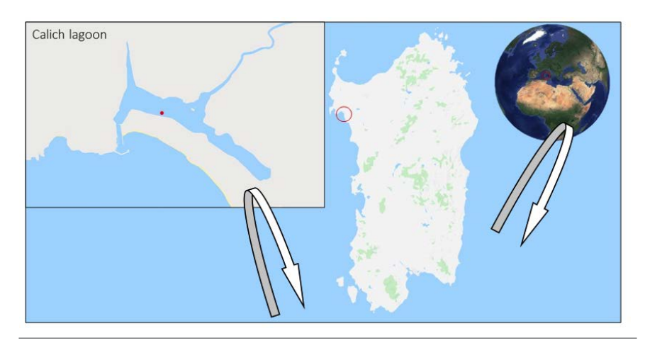
Figure 1. Map of Italy showing the location of Calich lagoon. Inset is the location of Italy on the world map. The study area in indicated with the red circle "o" and the sampling location with the red dot "•".