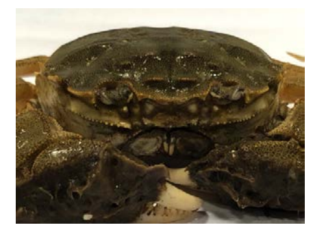
Figure 2. Frontal view of notch.