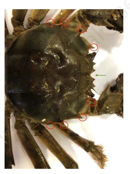
Figure 1. Dorsal view showing the frontal notch and four lateral spines.

The ASL control activity has highlighted