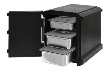
Figure 1. Isothermal container in expanded polypropylene (Polibox Smart Heater®).

Three steel gastronorms GN 1/1, 10 cm deep, completely filled with food and siled with their lids, were introduced in the PX SH in the following way: a first dish in the medium position, a second dish in the highest position and a side dish in the lowest position. The container loading was carried out in about 1.5 minutes. After loading, the container display reported a temperature loss of about 2-3°C. The temperatures were measured by means of three certified data loggers (Testo Saveris, model: T2D, cali-Calibration brated Certified Laboratories), positioned in the geometric centre of the gastronorms (immersed in the food). The container remained attached to the mains for 1 hour. It was then disconnected and moved by a vehicle suitable for the food transport to the microbiology and food inspection laboratory (VESPA). At the end of the experiment (after 3 hours) the container was reconnected to the mains electrical outlet, the temperature visible on the container display was 60.1°C, while the