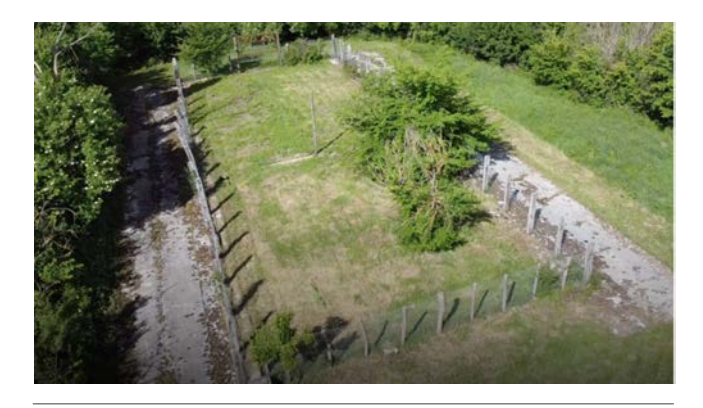
Figure 1. Large corral-style trap.

The results of pH measurements recorded at 1, 24, and 48 hours post-mortem are reported in Figure 2. Regarding pH determinations at 1 hour, there were no significant differences between T and SH, while CH resulted significantly different, with lower values as compared to the other groups. At 24 hours, the analogy between T and SH was confirmed, with a physiological decrease in pH values in both groups. At the same time, CH measurements significantly differed from the other 2 groups, and higher values were recorded. pH determinations at 48 hours were in line with those previously obtained at 24 hours, where T was lower than CH, while at this time SH did not show any statistical difference between T and CH. Concerning the meat color (Table 1), no difference in the L* values was detected between T and SH, while CH showed lower values than the other groups. Regarding b* and H values, the T group