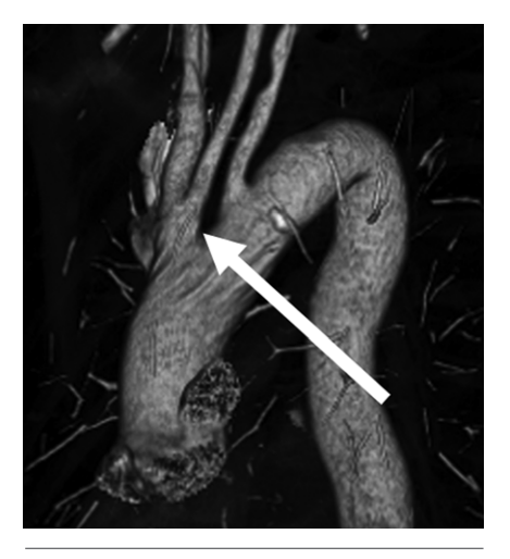
Figure 3. A 65-year old woman with bilateral internal carotid artery aneurysms: volume-rendering computed tomography angiography shows both a type-3 aortic arch and a bovine aortic arch (arrow). In this case, the navigation of the guiding catheter via both the right brachial artery and the femoral artery was unsuccessful.

Our results show that the type of aortic arch may be related to patient age. Liu et al. analyzed the aortic arch in 57 patients and concluded that there was no statistically significant difference in the arch elongation classification, the lesion length, the lesion calcification, or the stenosis severity between patients at an age of over 80 years and those under 80