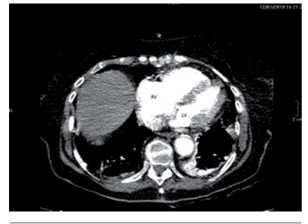
Figure 3. Enlarged right ventricle (RV), which was greater than the left ventricle (LV).

Prandoni et al. demonstrated that among patients who were hospitalized for a first episode of syncope in eleven different centers and who were not receiving anticoagulation therapy, pulmonary embolism was confirmed in 17.3% (approximately one of every six patients). The rate of pulmonary embolism was highest among those who did not have an alternative explanation for syncope.<sup>12</sup>