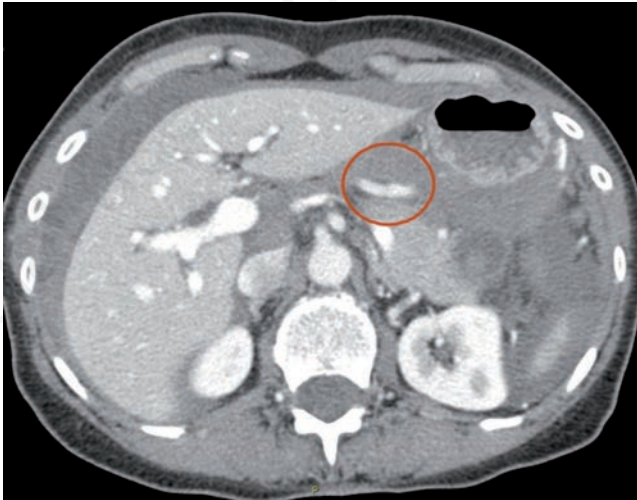
Figure 6. Contrast-enhanced computed tomography showing an aneurysm of 2 cm of diameter of the splenic artery aneurism (red circle).

unfit for surgery or those who may be treated in elective settings.<sup>5,9</sup> Nevertheless, a correct diagnosis, especially using bedside ultrasonography, significantly improves the correct management of patients having SAA in Emergency Room.