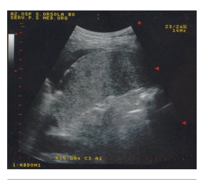
Figure 2. Ultrasonography: hypoechoic spots of the spleen and a moderate abdominal fluid collection.