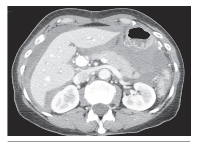
Figure 5. Contrast-enhanced computed tomography showing multiple infarctions of the spleen and bloody abdominal fluid collection.