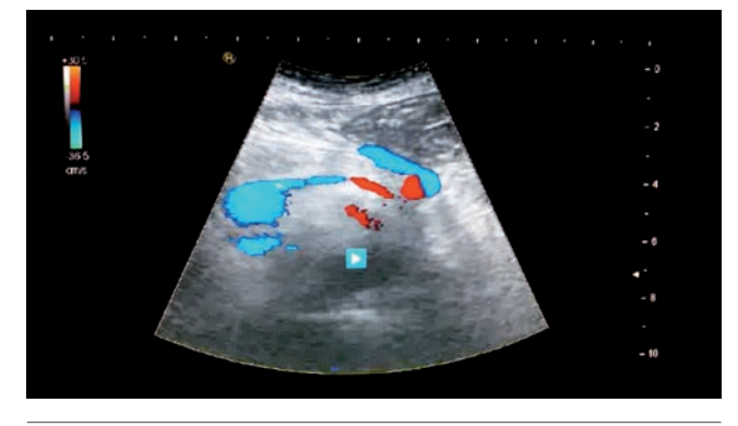
Figure 3. Ultrasound-color Doppler showing an aneurysmatic dilation of the splenic artery.