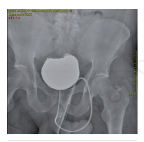
Figure 3. Retrograde cystography showing the complete repair of the bladder.

Acute and chronic alcohol consumption may cause several abdominal acute illnesses of a particular interest in an emergency situation.<sup>3</sup> In addition, it is sometimes difficult to clinically evaluate these patients because of their abnormal behavior.<sup>4</sup> Finally, the most common diseases in alcoholics are those involving the stomach and the pancreas and some abdominal emergencies are quite forgotten. One of these rare and generally unrecognized causes is represented by the bladder rupture. In 1959, Bastable et al. reported the highest amount of cases of spontaneous bladder ruptures1 and the author underlined that several of these cases reported were bladder ruptures associated with alcohol abuse. Subsequently, a total of 25 cases of spontaneous bladder rupture have been identified and these cases were associated with alcohol<sup>2,5,6</sup> or drug abuse.<sup>7</sup> In addition, this pathological condition was also described in decreased patients who regularly ingested