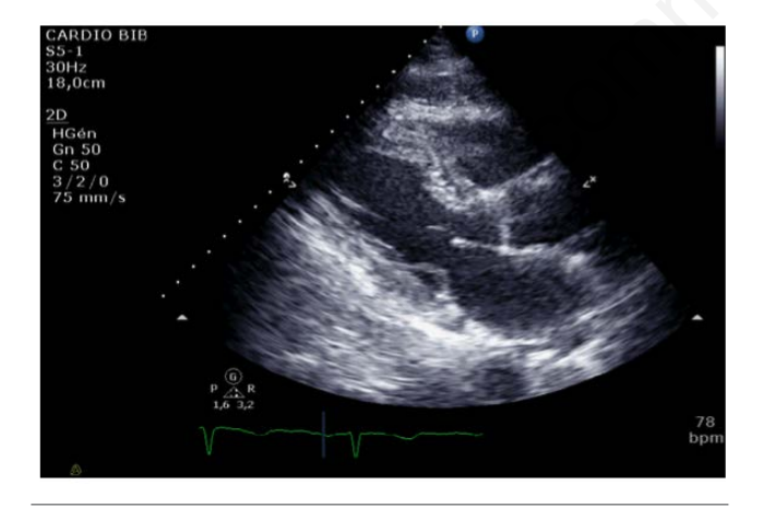
Figure 3. Control transthoracic echocardiography at 12 hours: complete right atrium thrombus dissolution.