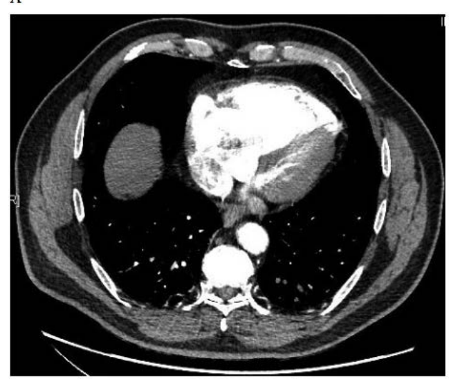
Figure 1. Injected tomodensitometry, in axial view. Massive pulmonary embolism with proximal obstruction of the both pulmonary arteries (A) and revealed a right atrium thrombus (B).