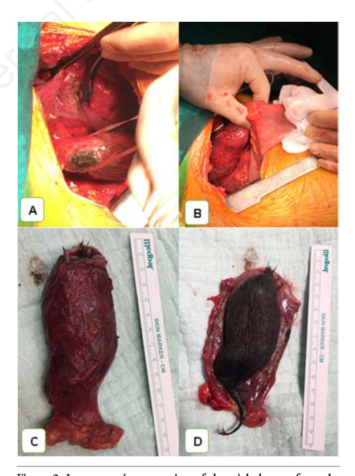
Figure 2. Intraoperative extraction of the trichobezoar from the distal esophagus. Perforated esophagus (A), isolated trichobezoar (B), resected esophagus (C), trichobezoar (D).