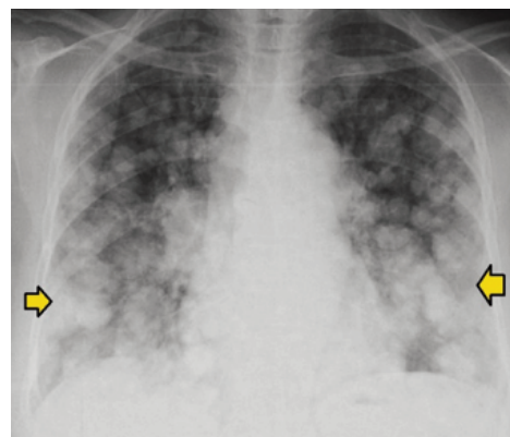
Figure 1. Seventy-one-year-old woman with endometrial cancer. Chest radiograph shows innumerable pulmonary nodules and masses with «cannonball» morphology.

The case report highlights the importance of early diagnosis in metastatic endometrial tumors, particularly when presenting as «cannonball» lung metastases. Flexible bronchoscopy aids in diagnosing lung pathologies with low complication rates. Transbronchial biopsy remains valuable despite advancements in radiology. Factors influencing lung metastasis rates include demographics, tumor characteristics, and socioeconomic status. Early recognition of metastatic nature is crucial for appropriate treatment and improved outcomes. Pulmonary metastasis from endometrial cancer is rare, emphasizing the significance of this case's presentation.