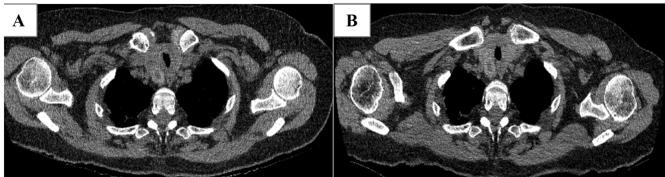
Figure 1. A) Computed Tomography (CT) scan of July 2023. B) CT scan of October 2023 after treatment with ICS/LABA for one month. ICS, Inhaled Corticosteroids; LABA, Long-Acting Beta-2-Agonist.

There is a case report in the literature involving the use of intravenous anesthesia with airway management using a thin endotracheal tube (Tritube) and a high oxygen flow rate ventilation technique (STRIVE-Hi) in tracheal masses. After the tumor has