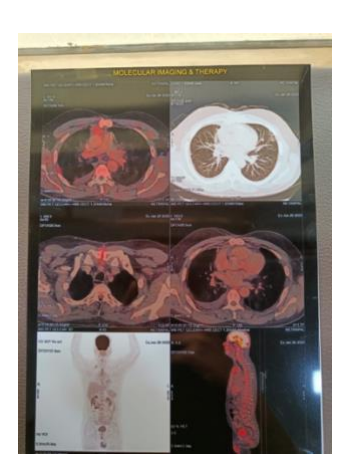
Figure 8. Post Procedural Positron Emission Tomography-Computed Tomography (PET-CT).

All claims expressed in this article are solely those of the authors and do not necessarily represent those of their affiliated organizations, or those of the publisher, the editors and the reviewers.