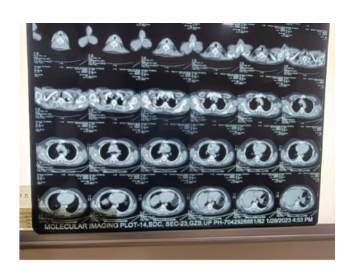
Figure 7. Post procedural Computed Tomography (CT) of chest.

All claims expressed in this article are solely those of the authors and do not necessarily represent those of their affiliated organizations, or those of the publisher, the editors and the reviewers.