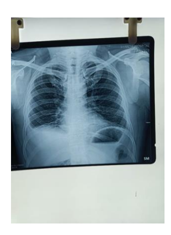
Figure 6. Post procedural chest X-Ray.

All claims expressed in this article are solely those of the authors and do not necessarily represent those of their affiliated organizations, or those of the publisher, the editors and the reviewers.