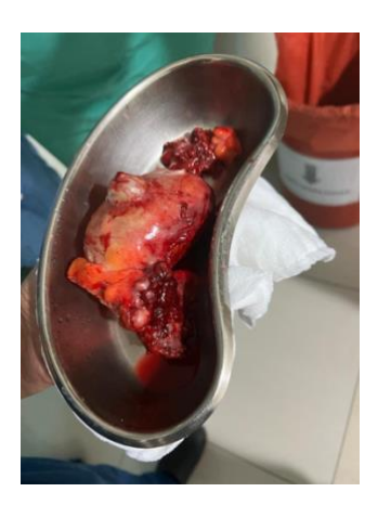
Figure 3. Post procedural specimen.

All claims expressed in this article are solely those of the authors and do not necessarily represent those of their affiliated organizations, or those of the publisher, the editors and the reviewers.