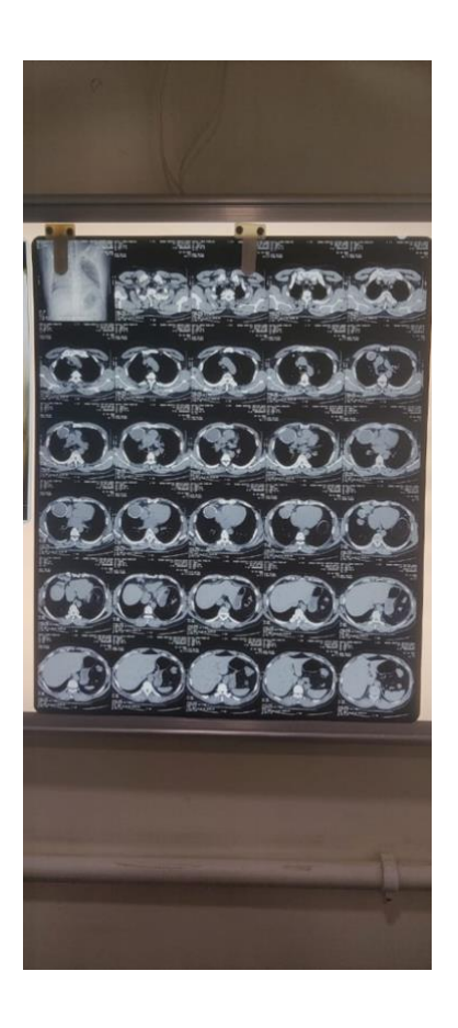
Figure 2. Pre-procedural Computed Tomography (CT) of chest.

All claims expressed in this article are solely those of the authors and do not necessarily represent those of their affiliated organizations, or those of the publisher, the editors and the reviewers.