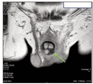
T1 weighted coronal image post-contrast