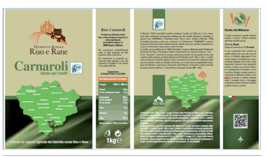
Figure 2. Layout of the Riso e Rane commercial product.

Before the product evaluation, judges had to carefully observe the package than make a preference judgment based on the questions in the test evaluating each question with a score from 1 to 9, where 1 represents a totally bad judgment and 9 an