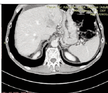
Figure 1. Contrast CT-scan showed a pancreatic neoplastic lesion between the pancreatic head and body and suspect hepatic secondary lesions.